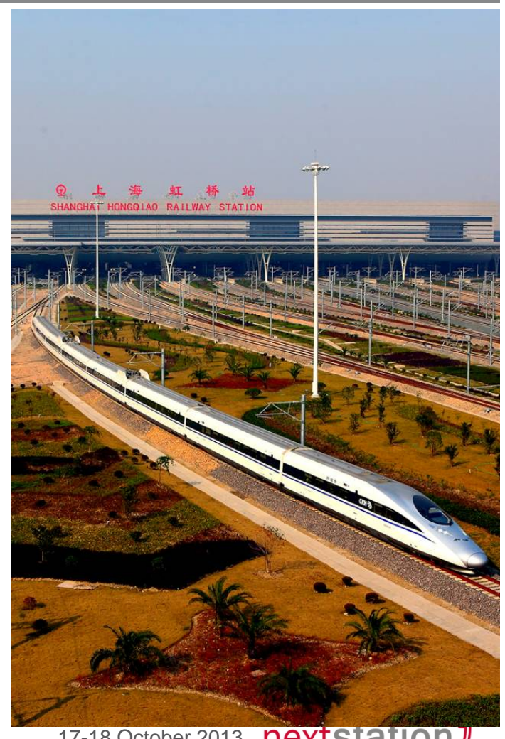
17-18 October 2013 Next Station 7 MOSCOW 2013